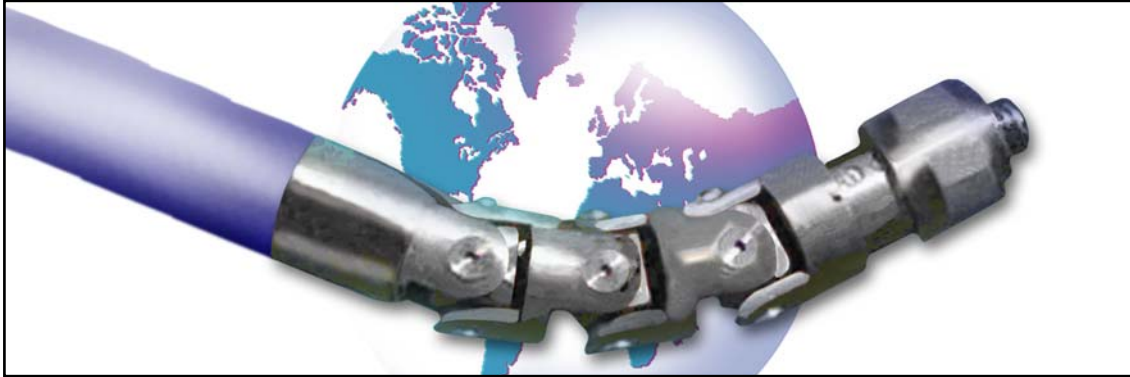
Universal Joint Bend Restrictor (un-mated half)