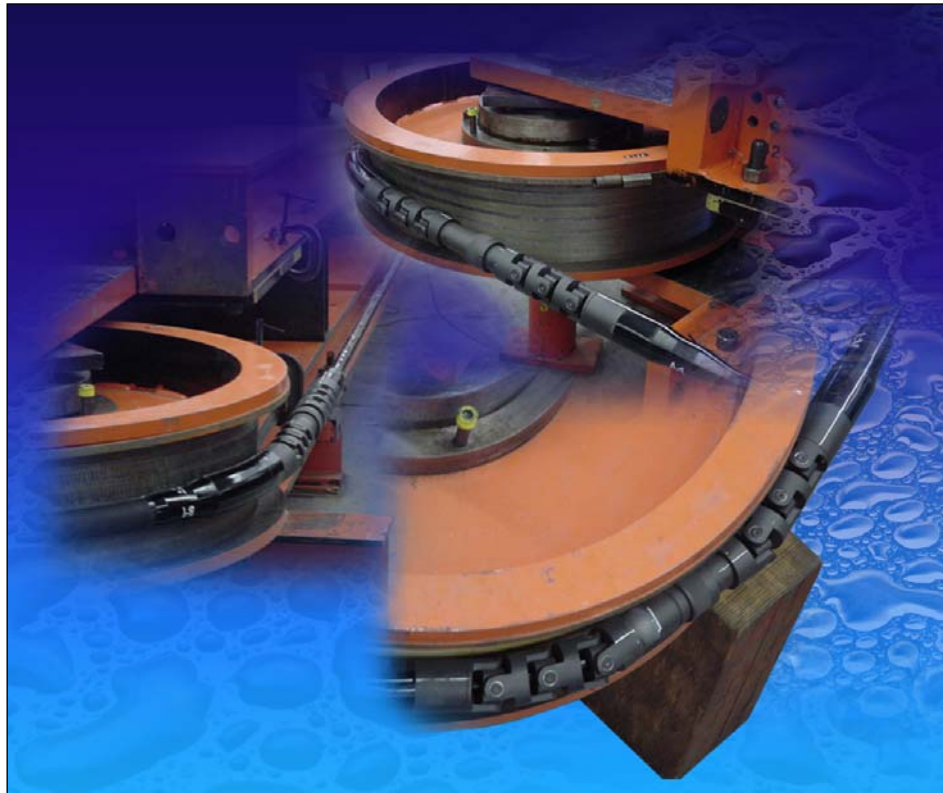
Dynamic cyclic bend of Bend Restrictor connector over 0.9m (36") diameter sheave