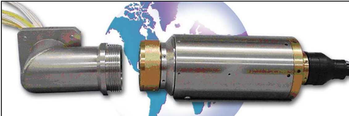
FCRL-RA &amp; CCPL-PBOF

All reasonable efforts have been taken to ensure that the information contained herein is accurate at the date of publication, but no representation or warranty as to the accuracy or completeness of such information is intended or to be implied by its inclusion herein. Any and all representations and warranties pertaining to the information and products referred to herein shall be set forth in SEACON® standard sales order form. In addition, SEACON® reserves the right to make changes to the contents hereof without notice, therefore it is suggested that at the time of inquiry, the appropriate sales office or factory be contacted directly for verification of published specifications and products availability.