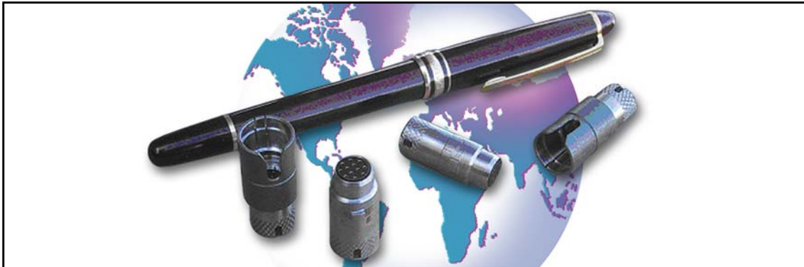
MMK 12#28-CCP & CCR Special Connector