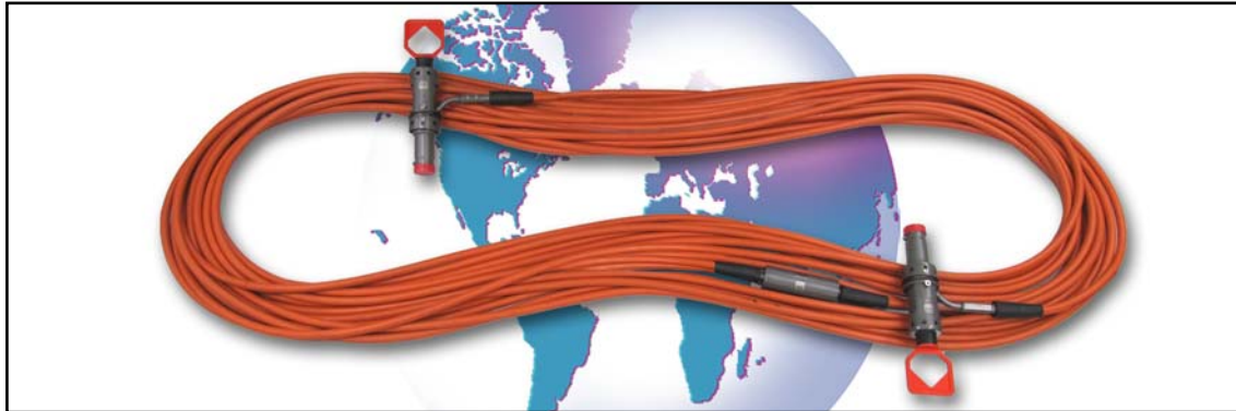
Optical Fiber Jumper System