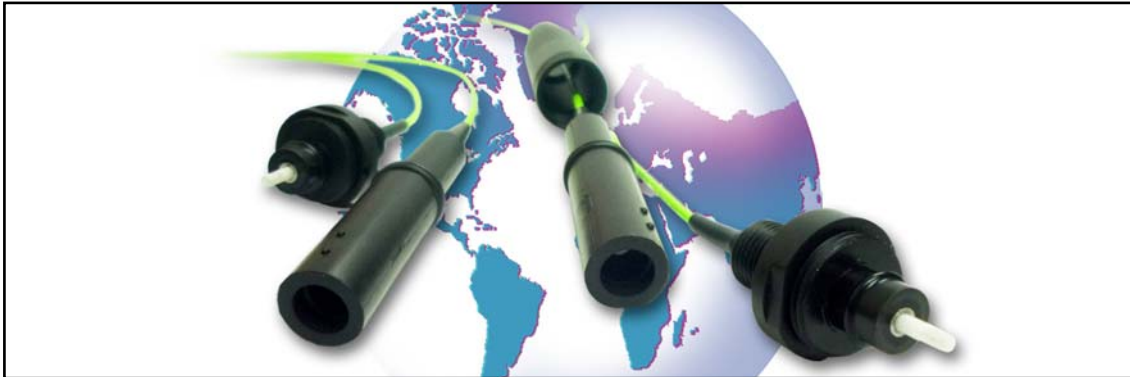
VS-8#22-ILMP-FI & VS-8#22-ILFS-FI